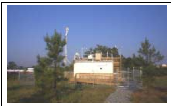
Figure 1. ARIES Core Site

Atmospheric measurements, exposure assessment, and health data in Atlanta are combined to test hypotheses concerning the health effects of PM 2.5